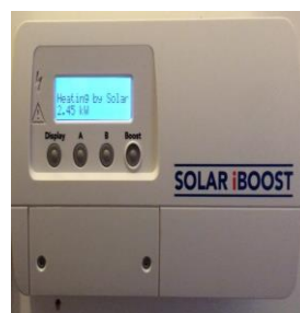
Figure 4: Diverter