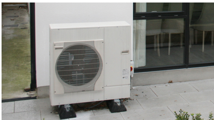
Figure 2: Air Source Heat Pump Outdoor Unit

Ground Source and Water Source: Ground source and water source heat pump systems are less common than air source units. A ground source heat pump system, also known as a geothermal heat pump system, uses the earth as a source of renewable heat. Heat is drawn from the ground through collector pipework and transferred to the heat pump. The ground collector can be laid out horizontally at a shallow depth below the surface or else vertically to a greater depth.